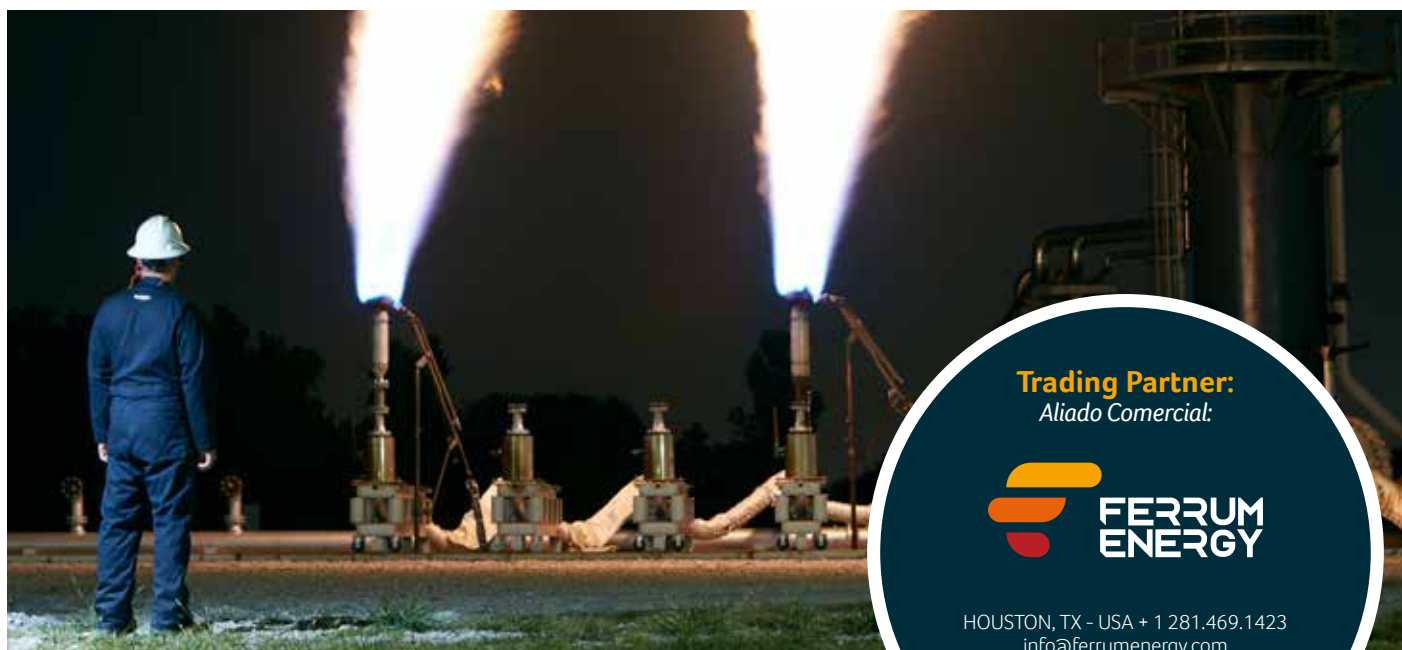
JZ INDAIR FIRST STAGE BURNERS

The first stage of most MFGF systems requires a burner design that can produce smokeless flaring at turndown from purge rate to maximum rate. This typically requires utilizing steam-assisted or air-assisted burners on the first stage, which adds complexity to the design and controls. It also requires continuous utility usage (steam or blower power). This increases the likelihood of over-steaming or over-aerating the burners which produces decreased hydrocarbon destruction efficiency. The JZ Indair first-stage burner design utilizes a variable-slot mechanism to produce 100 percent smokeless flaring from purge through maximum flow rate without the use of any outside utilities. This provides a low-maintenance, simple operation design that is guaranteed to produce high DRE without operator interface.