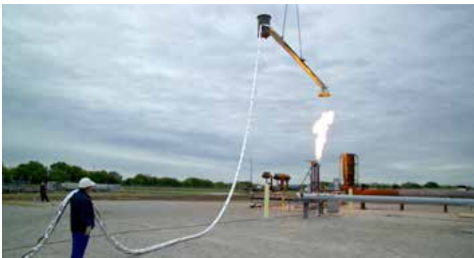
INDUSTRY-LEADING FLARE EMISSION TESTING EXPERTISE

Our engineers routinely perform CFD analysis on innovative flare technologies to optimize performance and streamline the development cycle of those new technologies. Those CFD simulation results are then validated by experimental data from our test facility. Our engineers also utilize CFD to assess flare performance and environmental impact at customer sites.