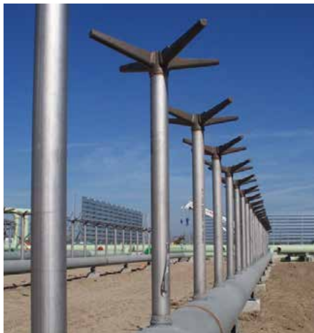
LRGO – HC BURNERS